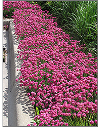
Dusseldorf Pride Sea Thrift in bloom

Dusseldorf Pride Sea Thrift is recommended for the following landscape applications;