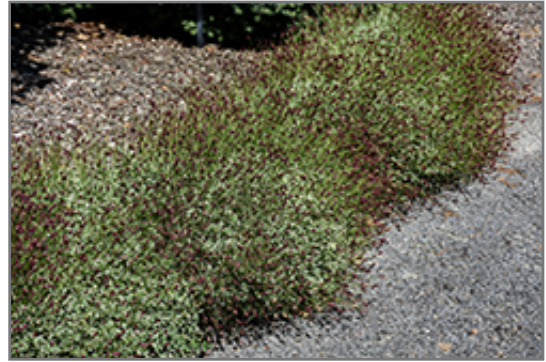
Little Angel Burnet in bloom