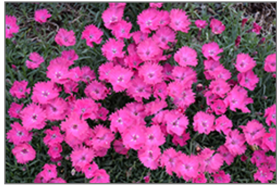
Vivid Bright Light Pinks flowers

Vivid Bright Light Pinks is recommended for the following landscape applications;