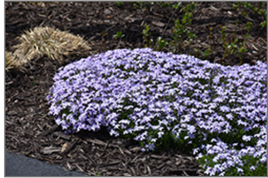
Spring Blue Moss Phlox in bloom