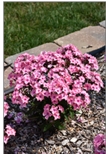
Sweet Summer Queen Garden Phlox in bloom