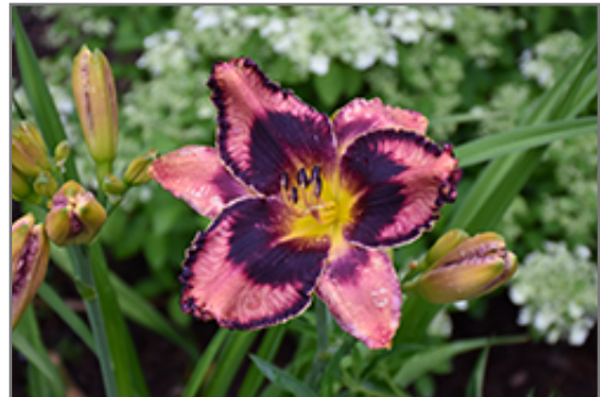
Rainbow Rhythm Storm Shelter Daylily flowers