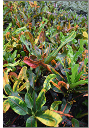
Mammy Croton in full

This is a dense herbaceous evergreen houseplant with an upright spreading habit of growth. Its wonderfully bold, coarse texture is quite ornamental and should be used to full effect. This plant should not require much pruning, except when necessary to keep it looking its best.