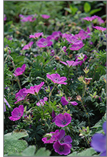
Max Frei Cranesbill flowers

This is a relatively low maintenance plant, and should only be pruned after flowering to avoid removing any of the current season's flowers. It is a good choice for attracting butterflies to your yard, but is not particularly attractive to deer who tend to leave it alone in favor of tastier treats. It has no significant negative characteristics.