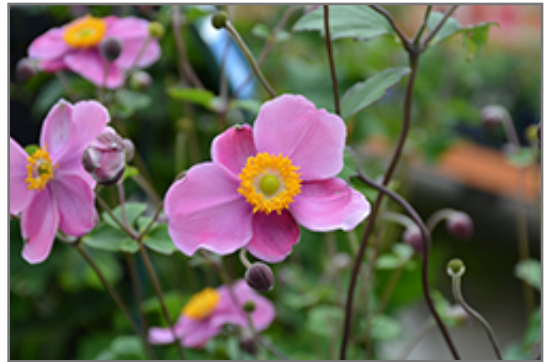
September Charm Anemone flowers