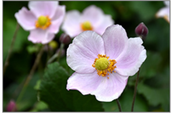
September Charm Anemone flowers

September Charm Anemone is recommended for the following landscape applications;