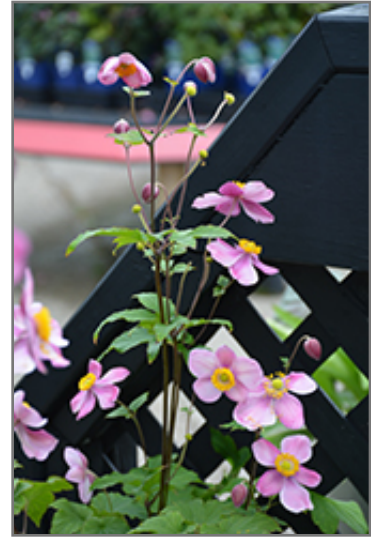
September Charm Anemone flowers

September Charm Anemone is a fine choice for the garden, but it is also a good selection for planting in outdoor pots and containers. With its upright habit of growth, it is best suited for use as a 'thriller' in the 'spiller-thriller-filler' container combination; plant it near the center of the pot, surrounded by smaller plants and those that spill over the edges. It is even sizeable enough that it can be grown alone in a suitable container. Note that when growing plants in outdoor containers and baskets, they may require more frequent waterings than they would in the yard or garden. Be aware that in our climate, most plants cannot be expected to survive the winter if left in containers outdoors, and this plant is no exception. Contact our experts for more information on how to protect it over the winter months.