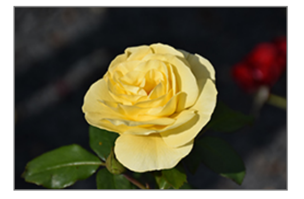
High Voltage Rose flowers