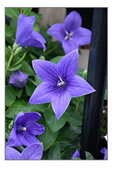
Pop Star Blue Balloon Flower flowers

Pop Star Blue Balloon Flower is recommended for the following landscape applications;