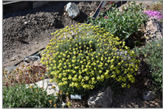
Kannah Creek Sulphur Flower Buckwheat in bloom

Kannah Creek Sulphur Flower Buckwheat is recommended for the following landscape applications;