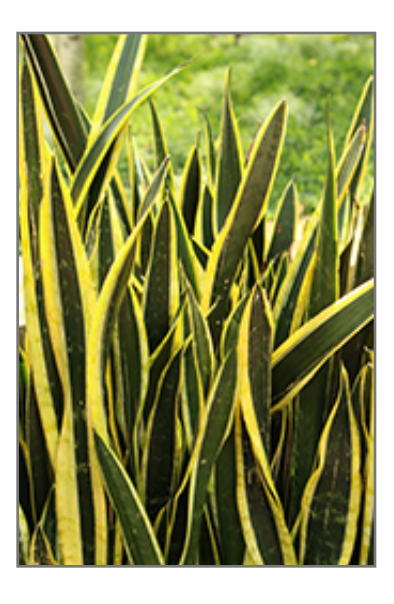
Black Gold Snake Plant foliage

When grown indoors, Black Gold Snake Plant can be expected to grow to be about 3 feet tall at maturity, with a spread of 12 inches. It grows at a slow rate, and under ideal conditions can be expected to live for approximately 10 years. This houseplant performs well in both bright or indirect sunlight and strong artificial light, and can therefore be situated in almost any well-lit room or location. It is very adaptable to both dry and moist soil, but will not tolerate any standing water. The surface of the soil shouldn't be allowed to dry out completely, and so you should expect to water this plant once and possibly even twice each week. Be aware that your particular watering schedule may vary depending on its location in the room, the pot size, plant size and other conditions; if in doubt, ask one of our experts in the store for advice. It will benefit from a regular feeding with a general-purpose fertilizer with every second or third watering. It is not particular as to soil pH, but grows best in sandy soil. Contact the store for specific recommendations on pre-mixed potting soil for this plant.