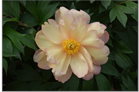
Singing in the Rain Peony flowers

Huge semi-double creamy blooms flushed with salmon-peach are held on strong stems above luxurious finely cut foliage; a profusion of blooms in late spring to early summer; perfect for cutting, or the perennial border